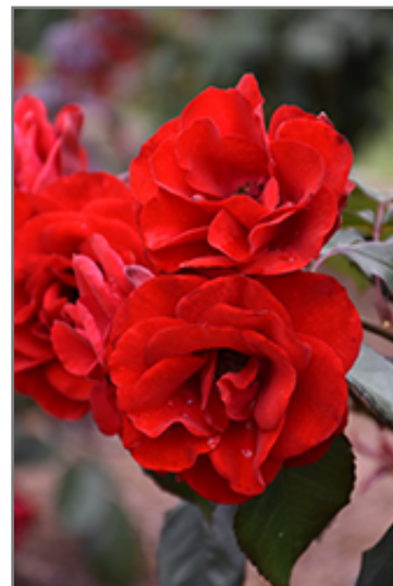
Europeana Rose flowers

The Europeana Rose is recommended for the following landscape applications;