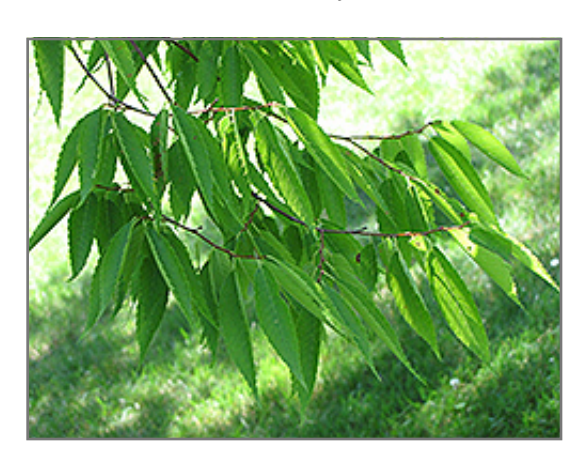
Japanese Zelkova foliage