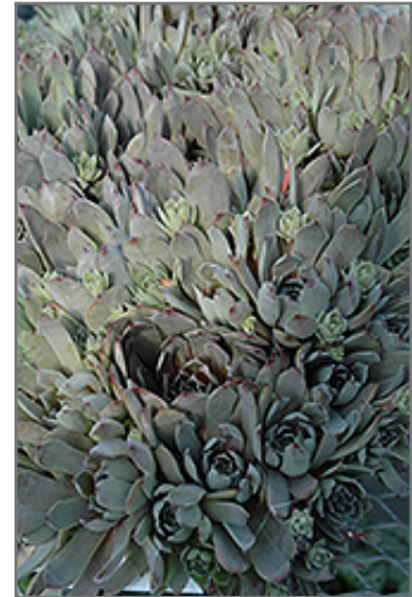
Big Blue Hens And Chicks

Big Blue Hens And Chicks is recommended for the following landscape applications;