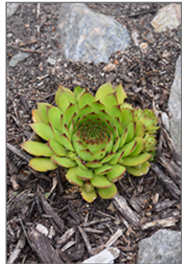
Sunset Hens And Chicks