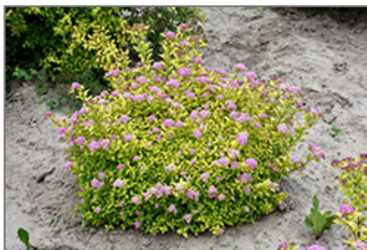
Sundrop Spirea in bloom