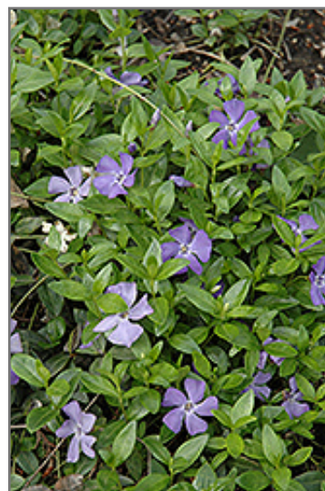
Common Periwinkle in bloom