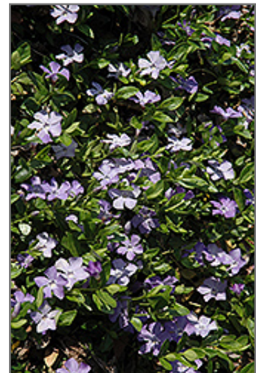
Common Periwinkle in bloom