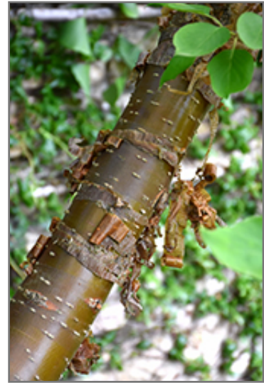
China Snow Pekin Lilac bark