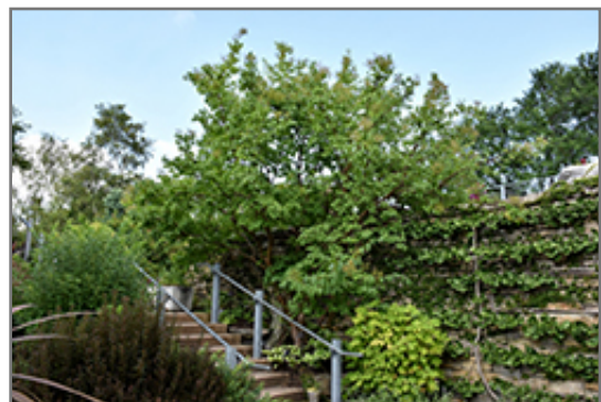
China Snow Pekin Lilac