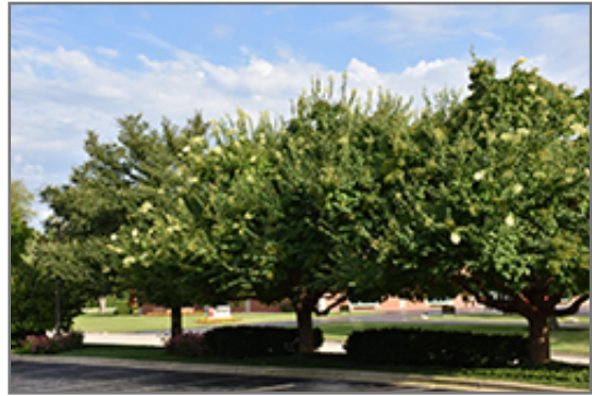
China Snow Pekin Lilac in bloom

This plant is not reliably hardy in our region, and certain restrictions may apply; contact the store for more information.