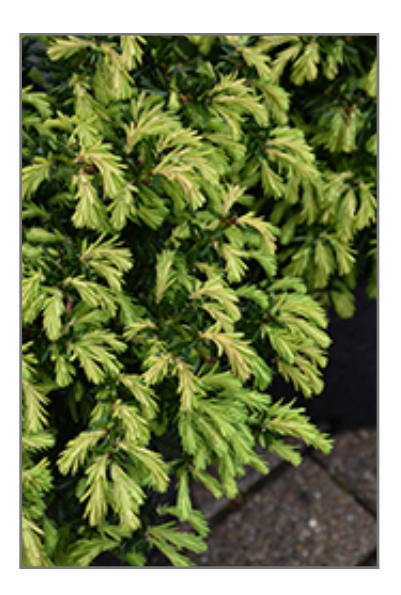
Everlow Yew foliage