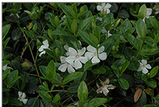
White Periwinkle flowers