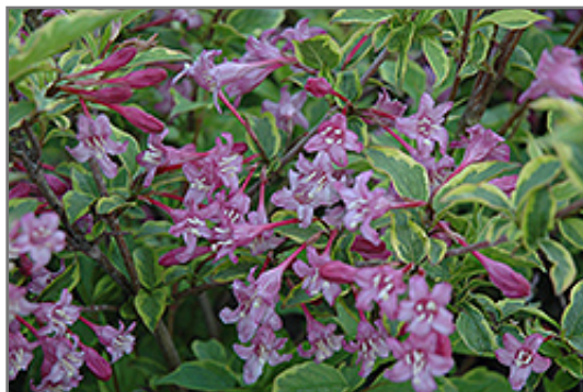
Golden Princess Weigela flowers