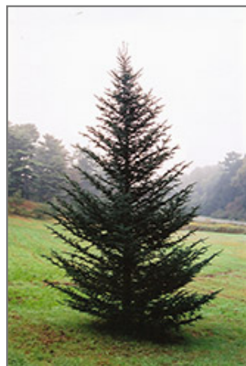
Fraser Fir

Fraser Fir will grow to be about 35 feet tall at maturity, with a spread of 20 feet. It has a low canopy, and should not be planted underneath power lines. It grows at a slow rate, and under ideal conditions can be expected to live for 70 years or more.