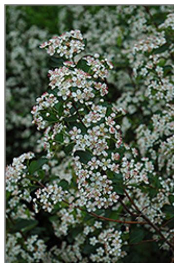
Black Chokeberry flowers