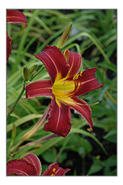
Navigator Daylily flowers