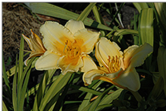
Miniature King Daylily flowers