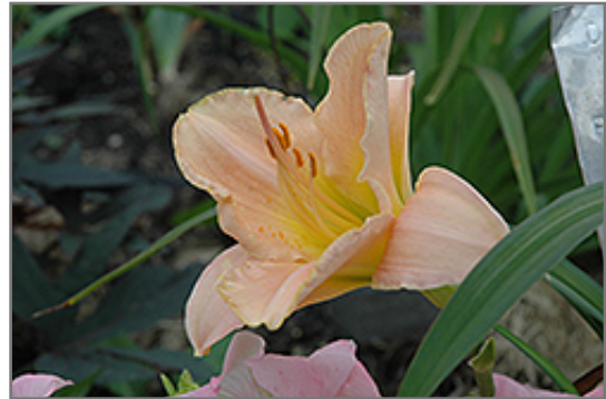
Ming Porcelain Daylily flowers