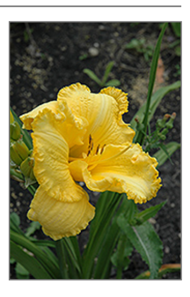
Fuss And Bother Daylily flowers