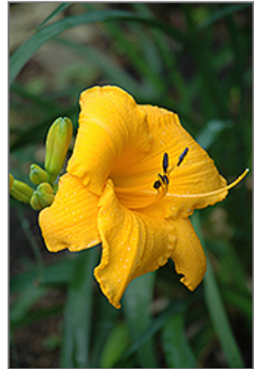
Decatur Gleam Daylily flowers