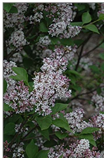
Manchurian Lilac flowers