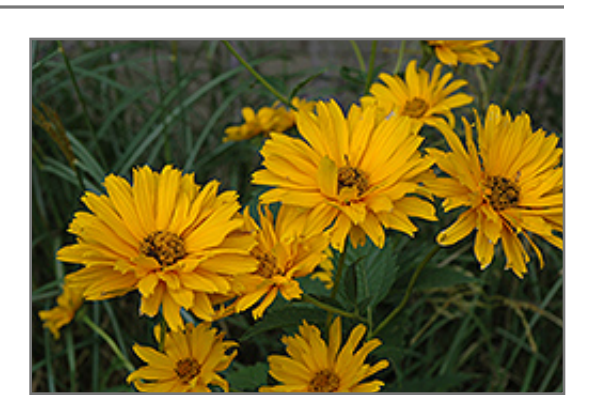
Ballerina False Sunflower flowers