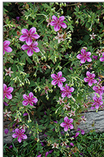
Starman Cranesbill flowers