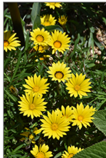
Colorado Gold Gazania flowers

Colorado Gold Gazania is recommended for the following landscape applications;