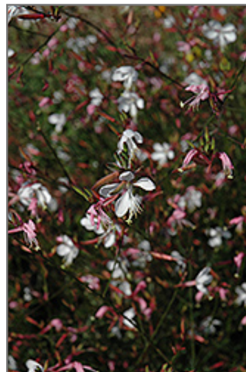
Snowstorm Gaura flowers

Snowstorm Gaura is recommended for the following landscape applications;