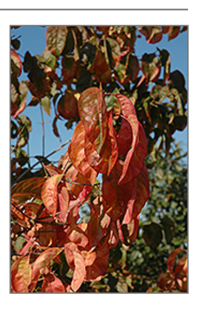
Eastern Wahoo in fall

Eastern Wahoo will grow to be about 25 feet tall at maturity, with a spread of 10 feet. It has a low canopy with a typical clearance of 2 feet from the ground, and is suitable for planting under power lines. It grows at a medium rate, and under ideal conditions can be expected to live for 40 years or more.