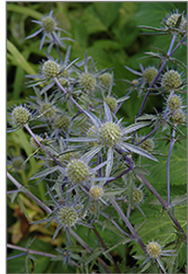
Blue Cap Sea Holly flowers

Blue Cap Sea Holly is recommended for the following landscape applications;