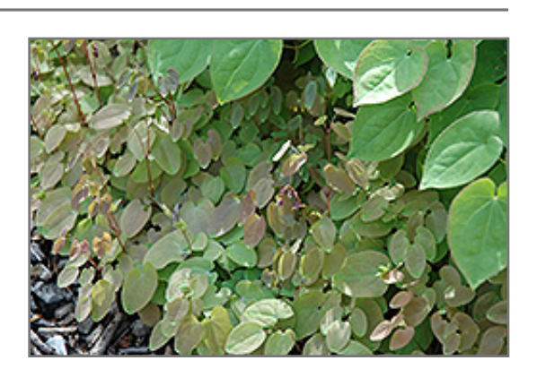
Pink Bishop's Hat foliage

Delicate lilac shooting star-like nodding flowers: shield-shaped green leaves have reddish mottling in spring and fall; makes a great groundcover that is tolerant of dry shade once established; also grows well in moisture if well-drained