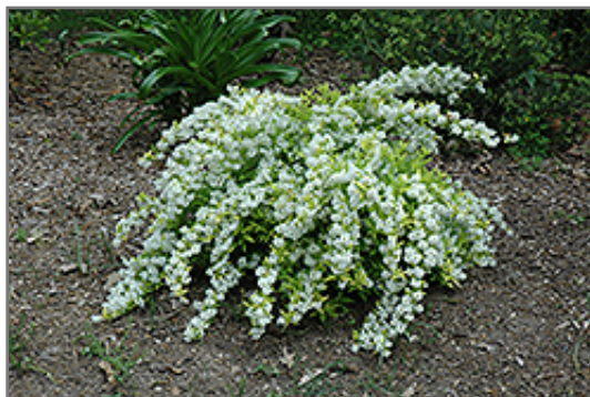
Chardonnay Pearls Deutzia in bloom