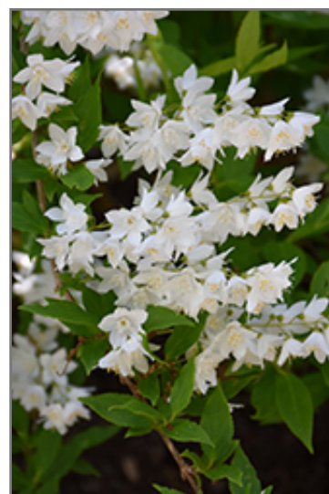
Chardonnay Pearls Deutzia flowers