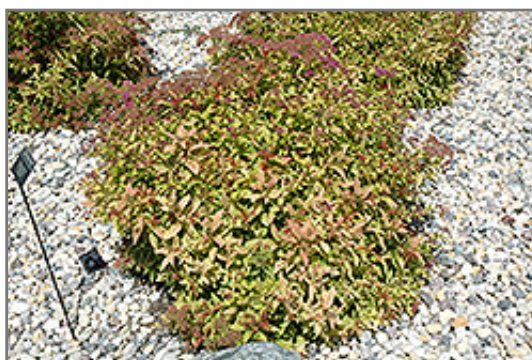
Flaming Mound Spirea