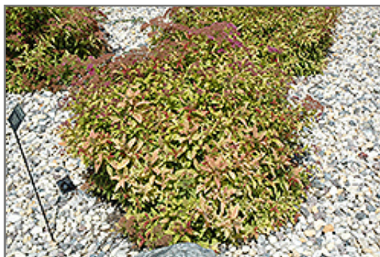
Flaming Mound Spirea