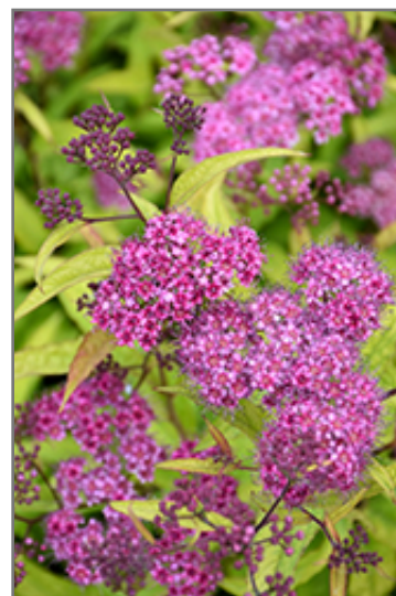
Flaming Mound Spirea flowers

Flaming Mound Spirea is recommended for the following landscape applications;