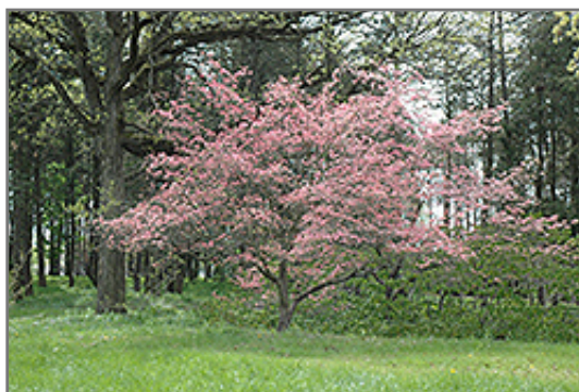
Sweetwater Red Flowering Dogwood in bloom