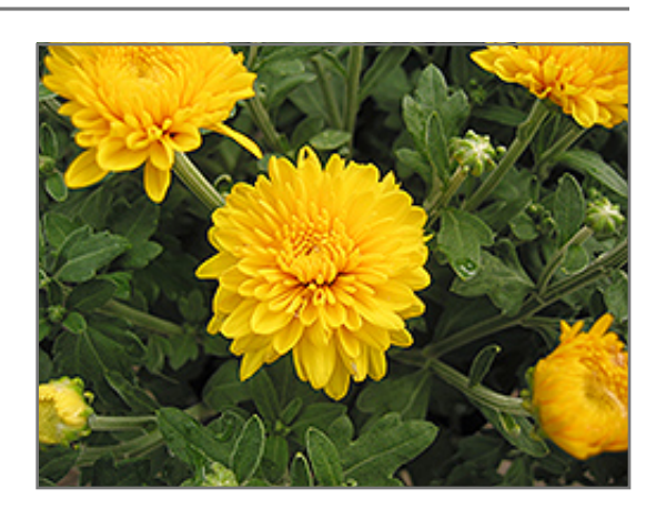
Yellow Ginger Chrysanthemum flowers

Yellow Ginger Chrysanthemum will grow to be about 24 inches tall at maturity, with a spread of 24 inches. It grows at a medium rate, and under ideal conditions can be expected to live for approximately 10 years. As an herbaceous perennial, this plant will usually die back to the crown each winter, and will regrow from the base each spring. Be careful not to disturb the crown in late winter when it may not be readily seen!