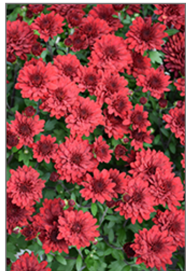
Five Alarm Red Chrysanthemum flowers