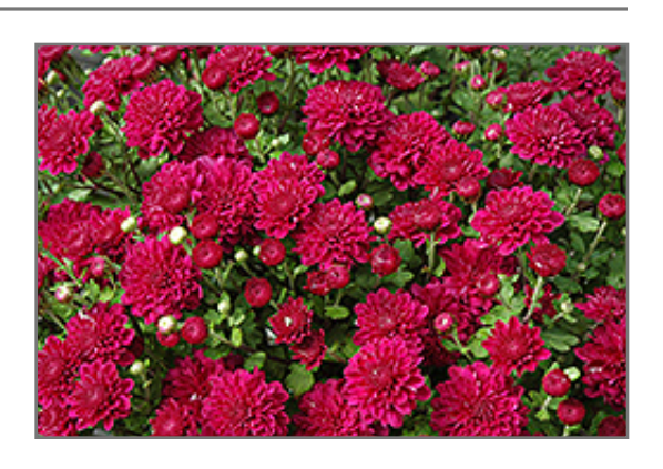
Darlene Chrysanthemum flowers

Darlene Chrysanthemum will grow to be about 20 inches tall at maturity, with a spread of 20 inches. It grows at a medium rate, and under ideal conditions can be expected to live for approximately 10 years. As an herbaceous perennial, this plant will usually die back to the crown each winter, and will regrow from the base each spring. Be careful not to disturb the crown in late winter when it may not be readily seen!