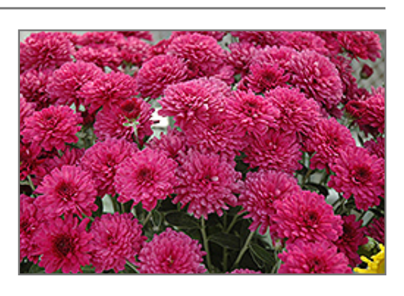
Beth Chrysanthemum flowers

Beth Chrysanthemum will grow to be about 18 inches tall at maturity, with a spread of 18 inches. It grows at a medium rate, and under ideal conditions can be expected to live for approximately 10 years. As an herbaceous perennial, this plant will usually die back to the crown each winter, and will regrow from the base each spring. Be careful not to disturb the crown in late winter when it may not be readily seen!