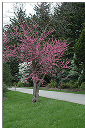
Pinkbud Redbud in bloom