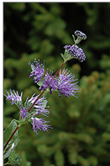
Blue Mist Caryopteris flowers