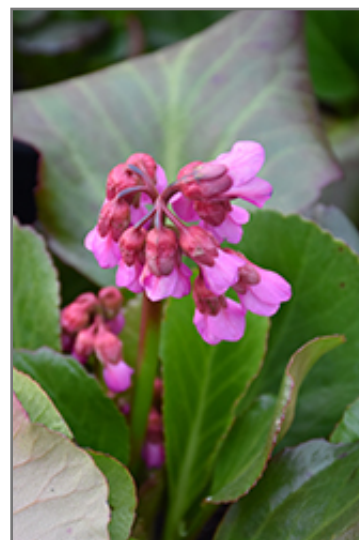
Bressingham Ruby Bergenia flowers