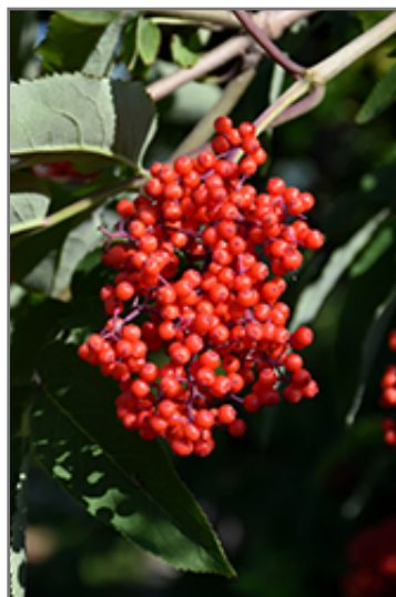
Red-Berried Elder fruit