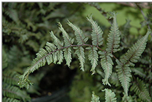
Applecourt Painted Fern foliage