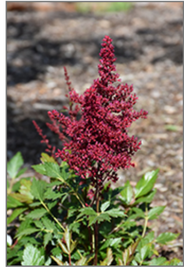
Red Sentinel Astilbe flowers

Red Sentinel Astilbe is a fine choice for the garden, but it is also a good selection for planting in outdoor pots and containers. With its upright habit of growth, it is best suited for use as a 'thriller' in the 'spiller-thriller-filler' container combination; plant it near the center of the pot, surrounded by smaller plants and those that spill over the edges. Note that when growing plants in outdoor containers and baskets, they may require more frequent waterings than they would in the yard or garden. Be aware that in our climate, most plants cannot be expected to survive the winter if left in containers outdoors, and this plant is no exception. Contact our experts for more information on how to protect it over the winter months.