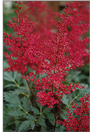
Red Sentinel Astilbe flowers