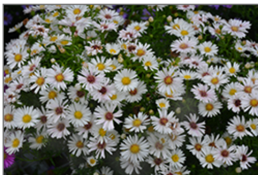
Puff White Aster flowers

Puff White Aster is recommended for the following landscape applications;