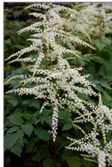
Misty Lace Goatsbeard flowers

Misty Lace Goatsbeard is recommended for the following landscape applications;