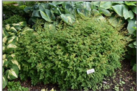
Misty Lace Goatsbeard

Misty Lace Goatsbeard will grow to be about 24 inches tall at maturity, with a spread of 24 inches. Its foliage tends to remain dense right to the ground, not requiring facer plants in front. It grows at a medium rate, and under ideal conditions can be expected to live for approximately 12 years. As an herbaceous perennial, this plant will usually die back to the crown each winter, and will regrow from the base each spring. Be careful not to disturb the crown in late winter when it may not be readily seen!