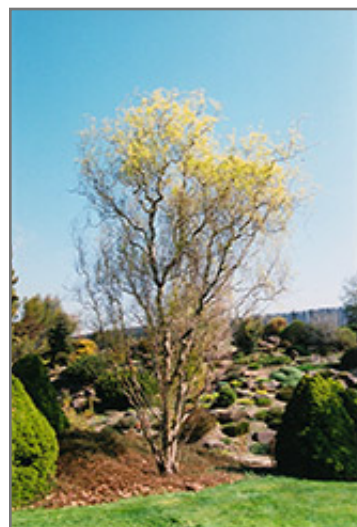
Dragon's Claw Willow in winter

Dragon's Claw Willow will grow to be about 30 feet tall at maturity, with a spread of 25 feet. It has a low canopy with a typical clearance of 2 feet from the ground, and should not be planted underneath power lines. It grows at a fast rate, and under ideal conditions can be expected to live for 40 years or more.