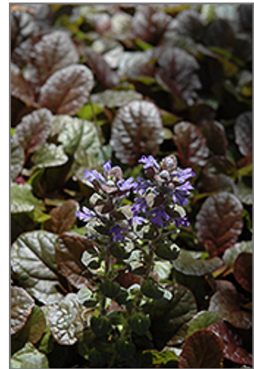
Purple Brocade Bugleweed flowers

Purple Brocade Bugleweed is recommended for the following landscape applications;