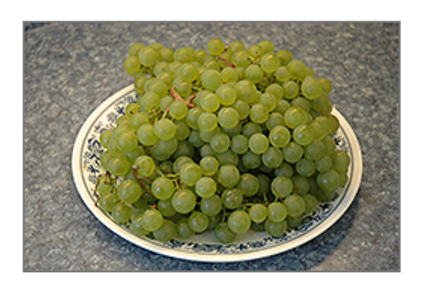
Morden 9703 Grape fruit

This is a dense multi-stemmed deciduous woody vine with a spreading, ground-hugging habit of growth. Its relatively coarse texture can be used to stand it apart from other landscape plants with finer foliage. This is a high maintenance plant that will require regular care and upkeep, and requires a special pruning regimen to reliably produce fruit; consult a specific reference guide or contact the store for proper pruning techniques. It is a good choice for attracting birds to your yard. Gardeners should be aware of the following characteristic(s) that may warrant special consideration;