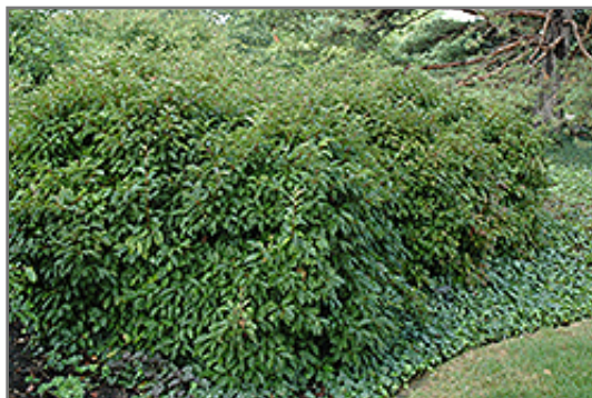
Dwarf Fragrant Viburnum