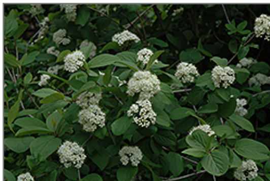
Manchurian Viburnum flowers