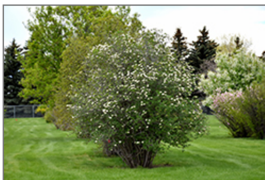
Manchurian Viburnum flowers