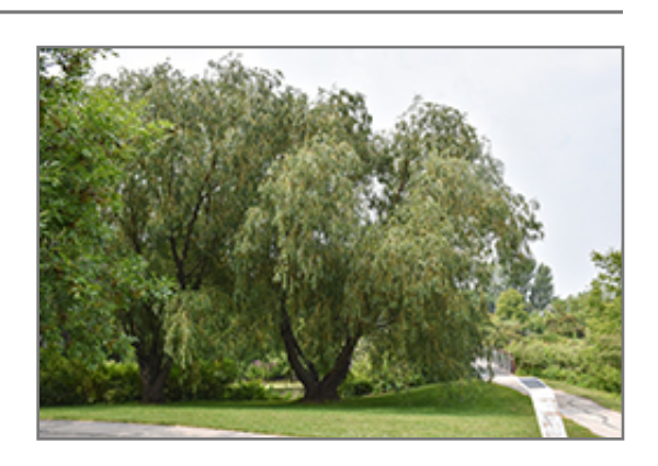
Wisconsin Weeping Willow

Wisconsin Weeping Willow will grow to be about 40 feet tall at maturity, with a spread of 40 feet. It has a low canopy with a typical clearance of 1 foot from the ground, and should not be planted underneath power lines. It grows at a fast rate, and under ideal conditions can be expected to live for 50 years or more.