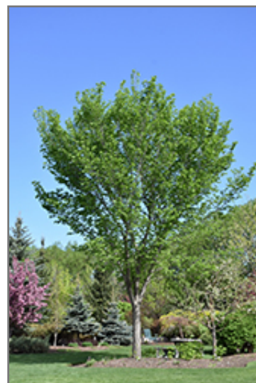
Brandon Elm