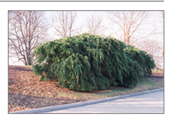
Sargent's Weeping Hemlock