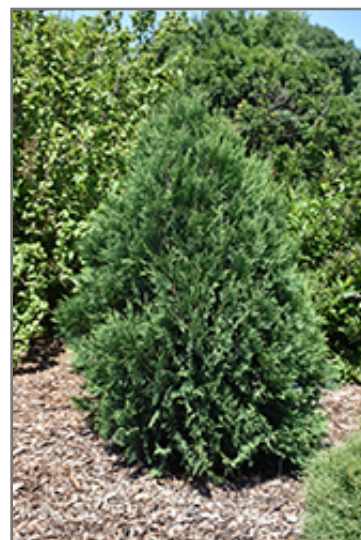
Technito Arborvitae