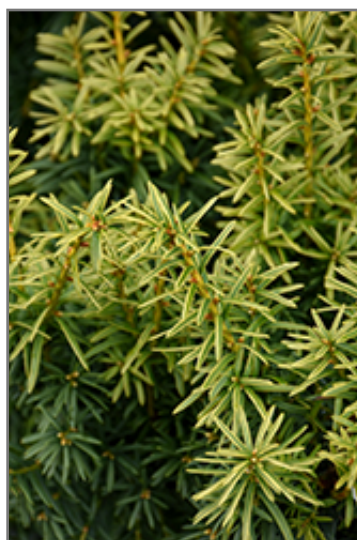
Dwarf Bright Gold Yew foliage